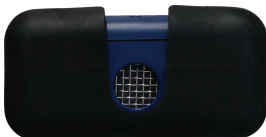
Ruggedized boot and Stand Included