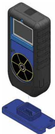
Ruggedized boot and Stand (Included)