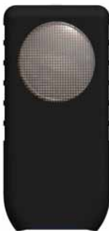
View of Back